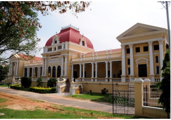
Oriental Research Institute (1891)