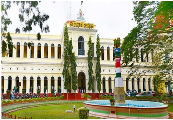
Maharaja's College (1889)